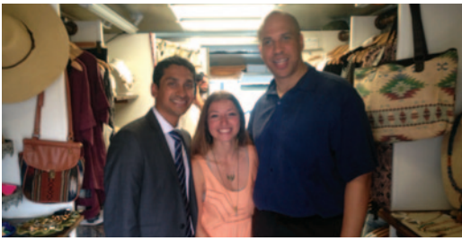
H. July 14, 2013 New work in Newark