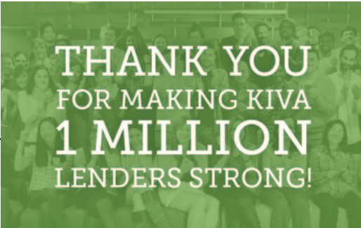
K. October 7, 2013 1 MILLION LENDERS!