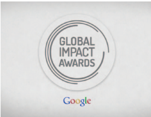
O. December 12, 2013 "A healthy disregard for the impossible."