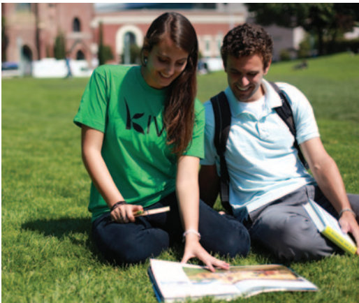
J. August 27, 2013 Kiva U: A movement to change the world